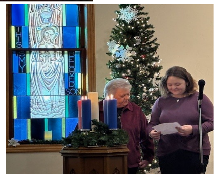
Fourth Advent Candle Lighting