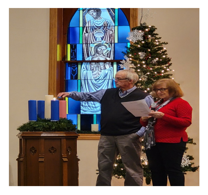
First Advent Candle Lighting