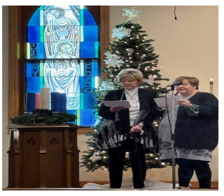
Second Advent Candle Lighting