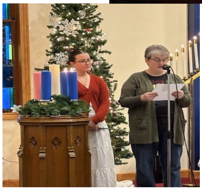
Third Advent Candle Lighting