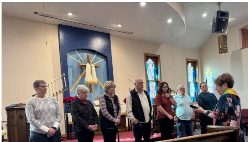
Council Members for 2025